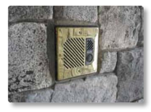
Flush-Mounted 8028 SIP Doorphone using Brass Faceplate